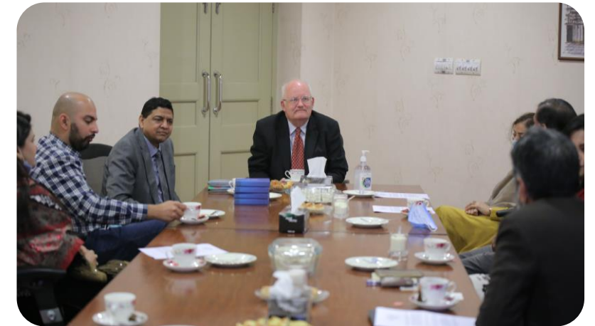
Meeting with Rector of FC College, Lahore