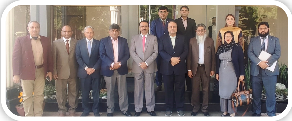
NACTE Team with Vice Chancellor, Islamia University, Bahawalpur.