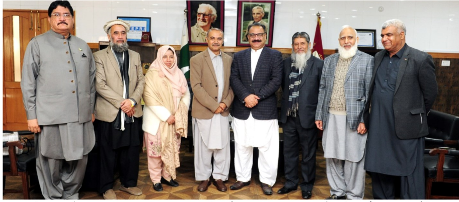
مردان۔ نیشنل ایکریڈیشن کونسل فار نیچر ایجوکیشن (NAECT) وفد کا وائس چانسلر عبدالولی خان یونیورسٹی یرو فیئر ڈاکٹر ظہور الحق کے ساتھ گروپ فوٹو