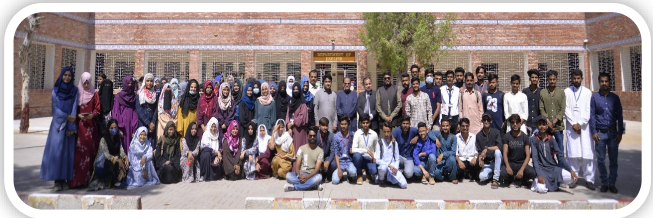
NACTE Team with HoD, Staff and Students of Department of Education, GCU, Hyderabad.