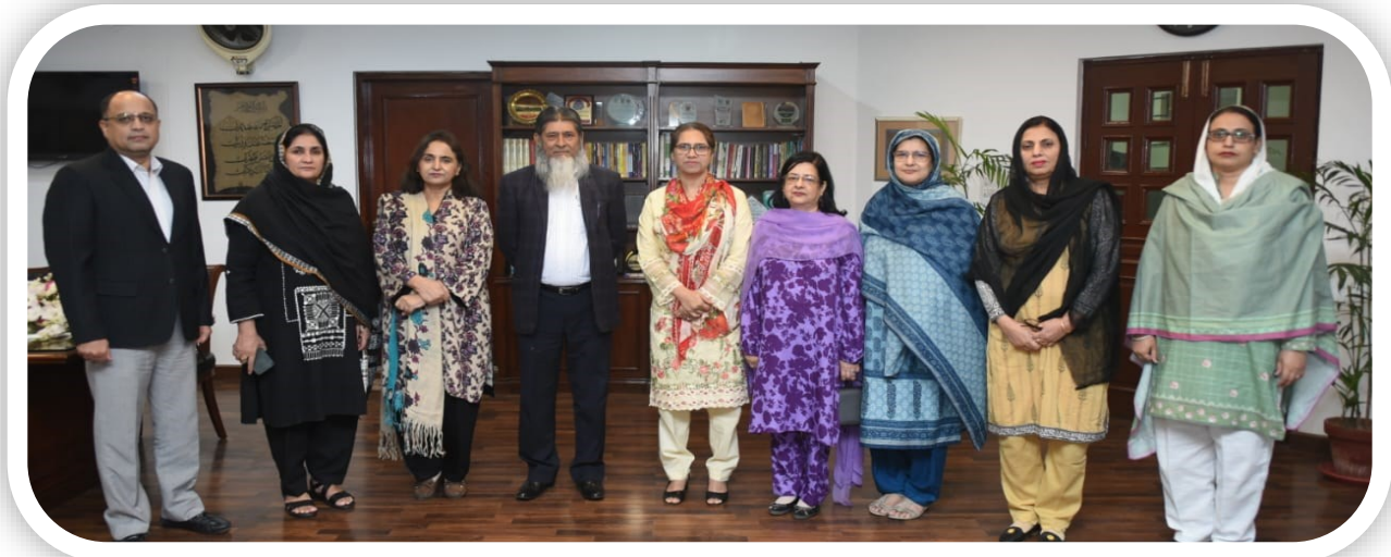
NACTE Team with Vice Chancellor, Lahore College for Women University, Lahore.