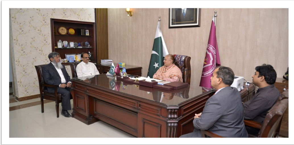
NACTE Team with Vice Chancellor, Government College University, Hyderabad.