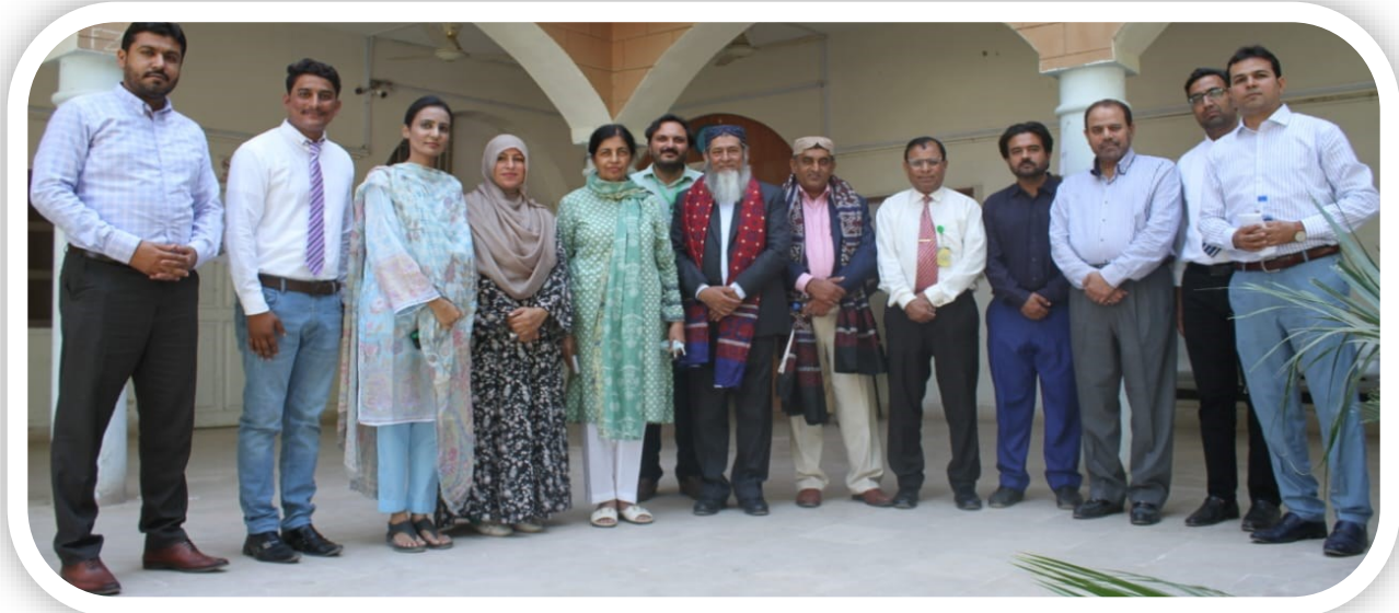
NACTE Team with Vice Chancellor, University of Sufism and Modern Sciences, Bhitsah.