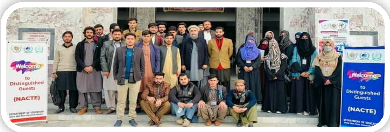
NACTE Team with HoD, Staff and Students of Department of Education, AWKU, Mardan.