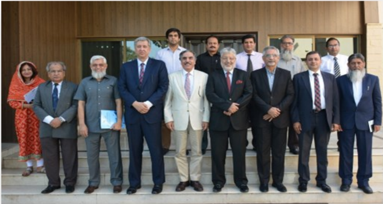
Chairpersons and Officials of Accreditation Councils with Chairman HEC.