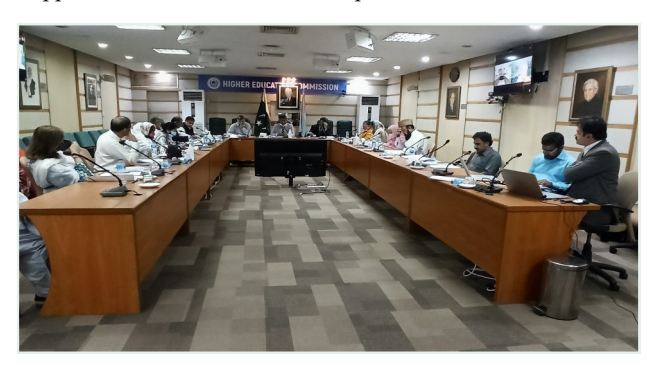
18th Council Meeting